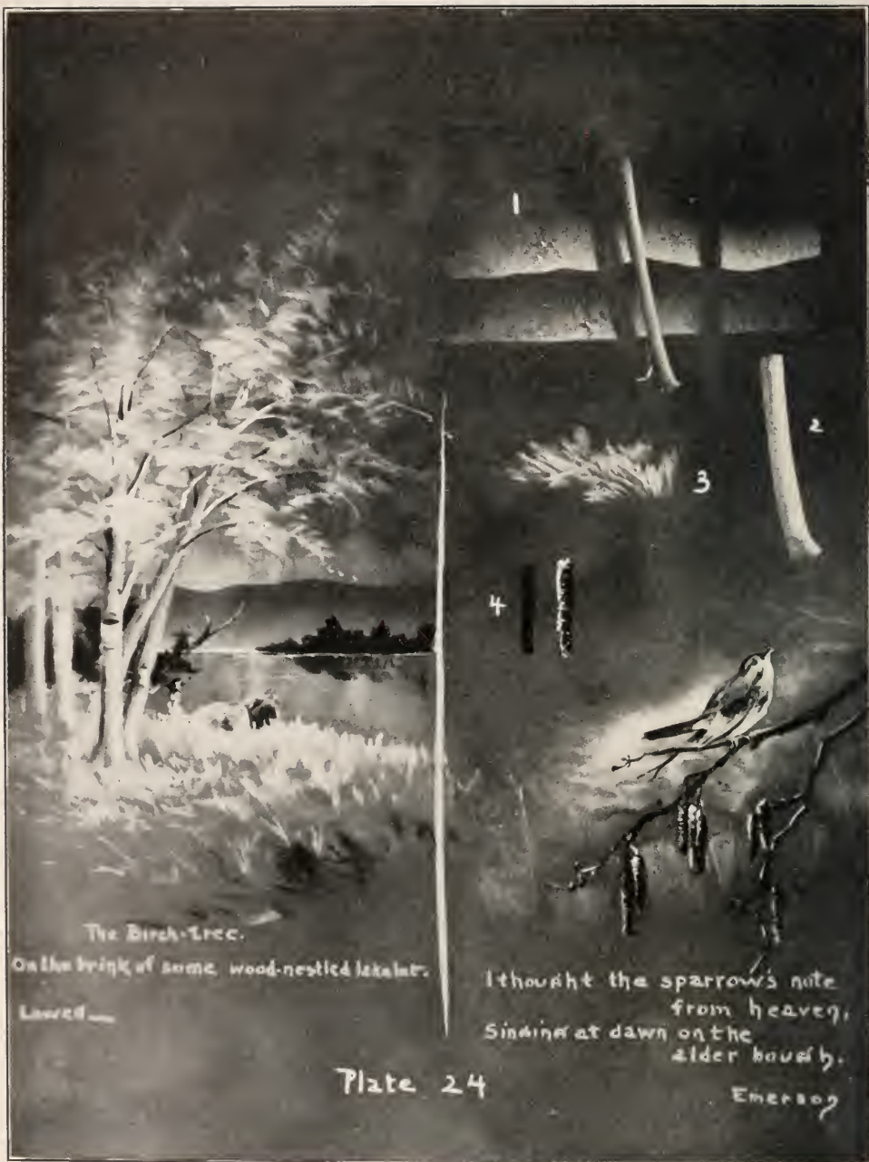
The Birch-Tree. On the brink of some wood-nestled lakelet. Lowell

I thought the sparrow's note from heaven, Singing at dawn on the elder boughs. Emerson